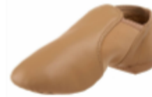
Capezio Theatre Boot Style # EJ2C Color: Caramel