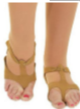
Balera Half Sole Jazz Shoe Style # B230 Color: Tan