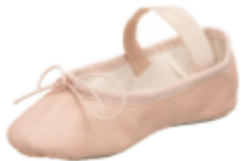
Capezio Ballet Slipper Style # 205C Color: Ballet Pink

Footless or convertible tights, any color.