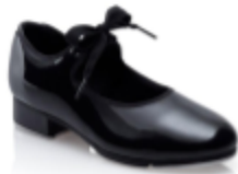
Capezio Tap Shoe Style # N625C Color: Black Patent or White