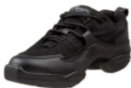
Capezio Fierce Dansneaker Style # DS11 Color: Black