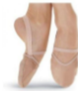
Capezio Pirouette Lyrical Shoe Style # H062 Color: Nude