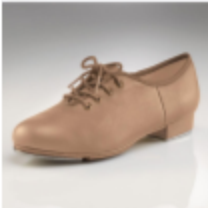
Capezio Fluid Tap Shoe Style # CG17 or CG17C Color: Caramel