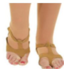
Balera Half Sole Sandal Style # B230 Color: Tan