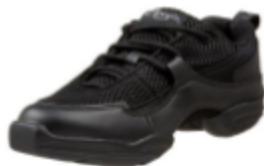
Capezio Fierce Dansneaker Style # DS11 Color: Black