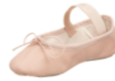
Capezio Ballet Slipper Style # 205 or 205C Color: Ballet Pink